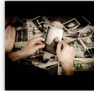
帧 / 幀 zhēn

Printed pictures, photographs. Please Note: 张 / 張 (zhāng) can also be used to "measure" photographs. It emphasizes that they are flat.