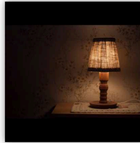
盏 \ 盞 zhǎn